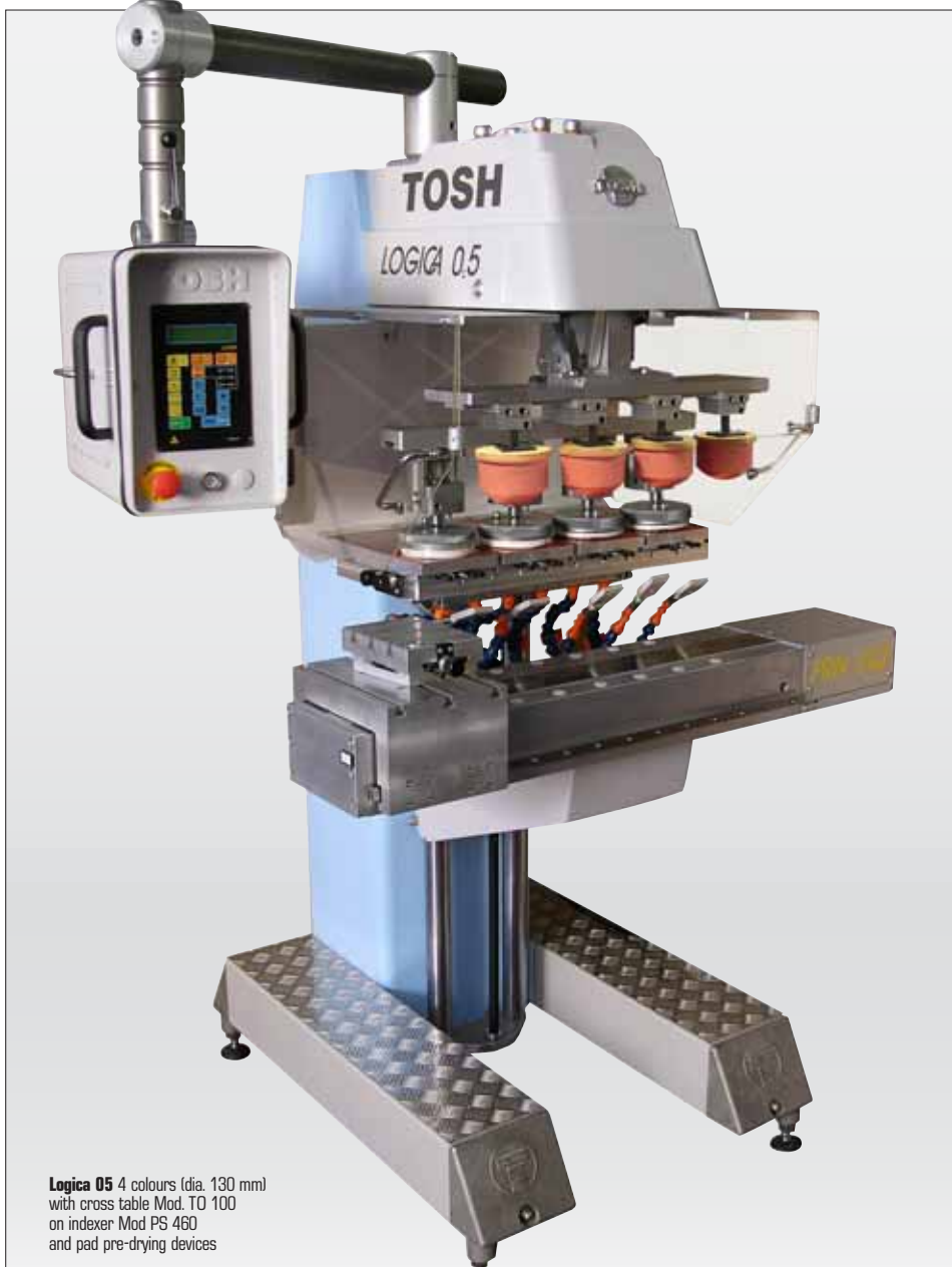
Logica 05 4 colours (dia. 130 mm) with cross table Mod. TO 100 on indexer Mod PS 460 and pad pre-drying devices